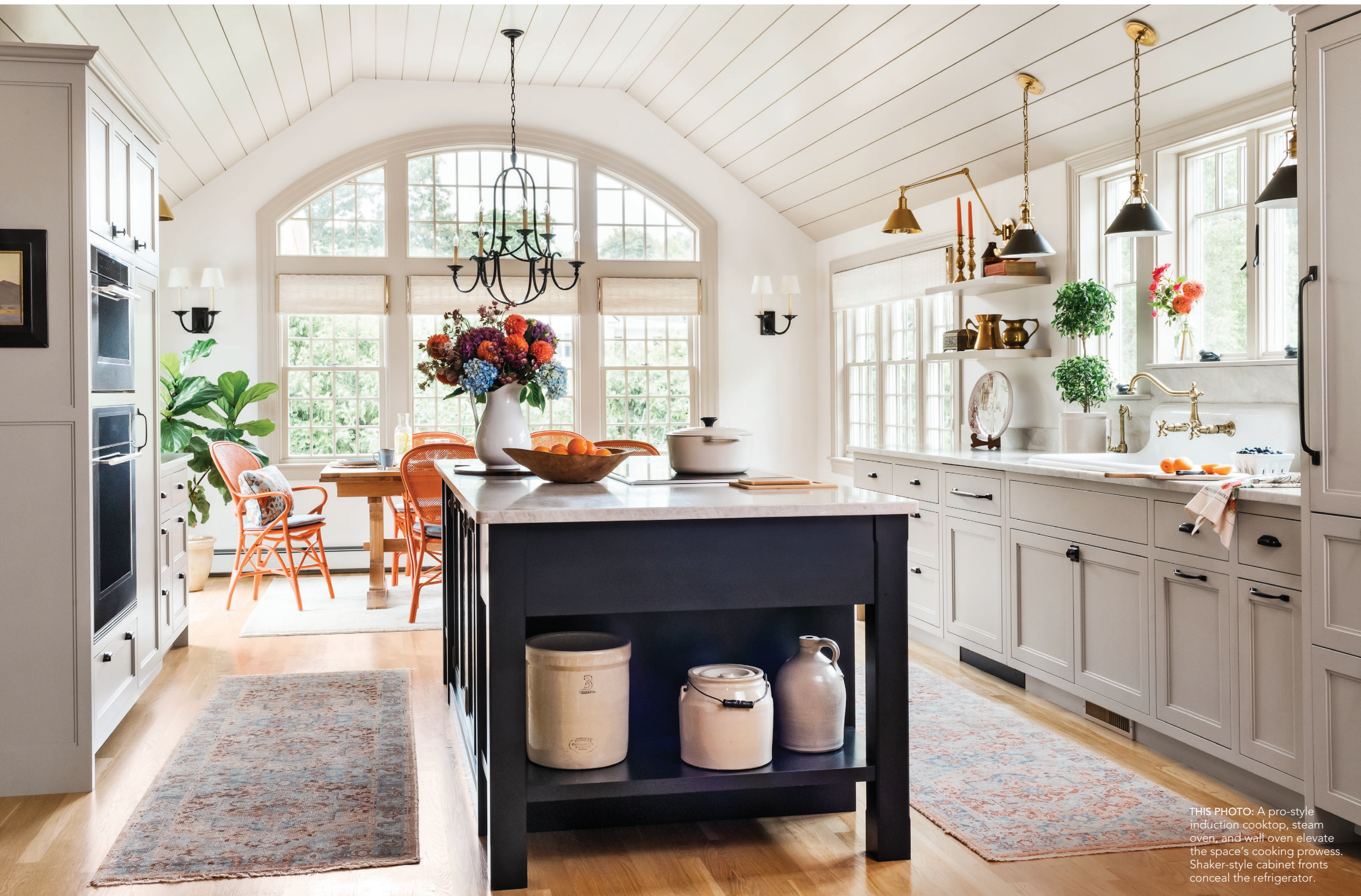
THIS PHOTO: A pro-style induction cooktop, steam oven, and wall oven elevate the space's cooking prowess. Shaker-style cabinet fronts conceal the refrigerator.